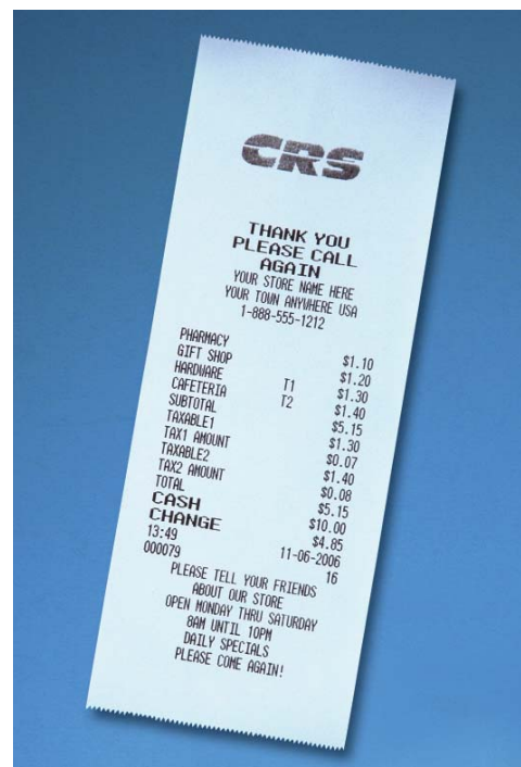
Thermal Receipt Shown 60% Actual Size