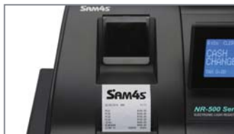
2 Station Printer