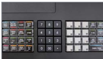
48 Raised Keys