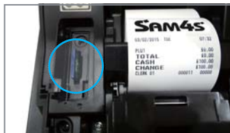
SD Card Slot