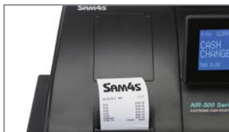
1 Station Printer