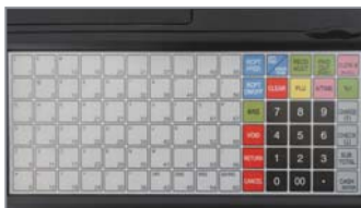
90 Flat Keys